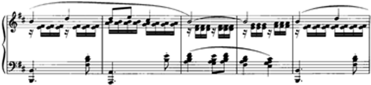
Figure 4: In That Distant Place (39–42). Source: (Chu, 2010)