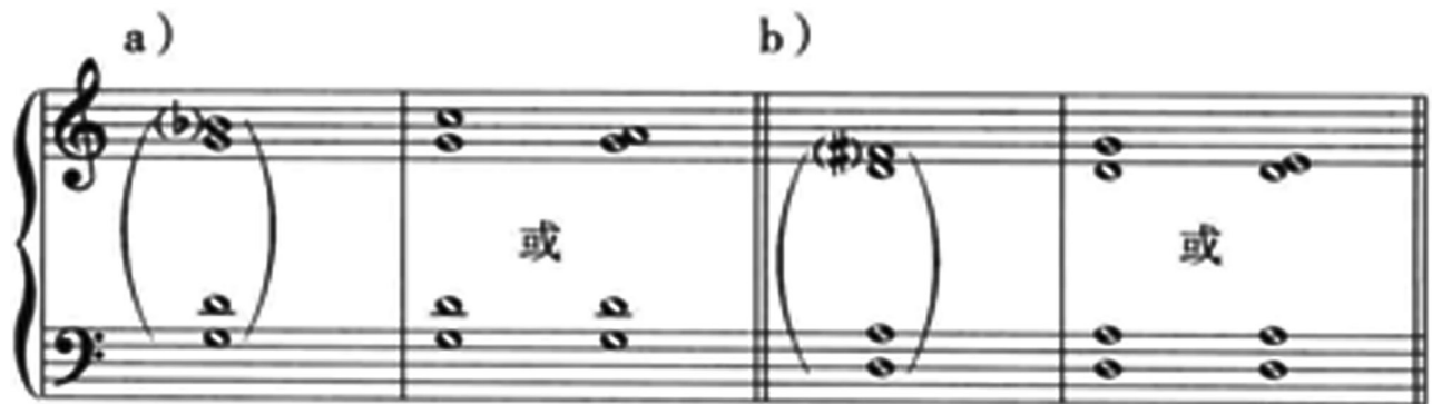
Figure 1: Alternate chord.