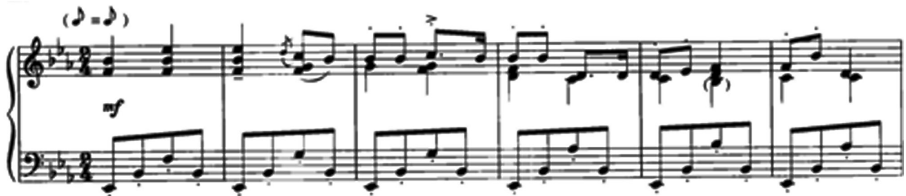
Figure 10: Guessing Riddles.