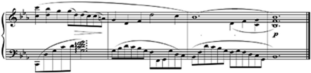
Figure 3: Variation No. 1.