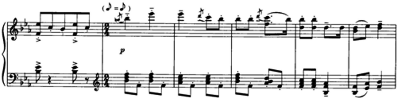
Figure 9: Guessing Riddles.

Chu Wanghua's design of accompaniment patterns for folk song melodies provides rich and sensible information for impromptu accompaniment teaching. In teaching impromptu accompaniment, teachers can lead students to analyse these piano pieces and the design methods of accompaniment patterns in these piano pieces. Meanwhile, students can learn various accompaniment styles by playing these successful examples of adapted music (Cai, 2014).