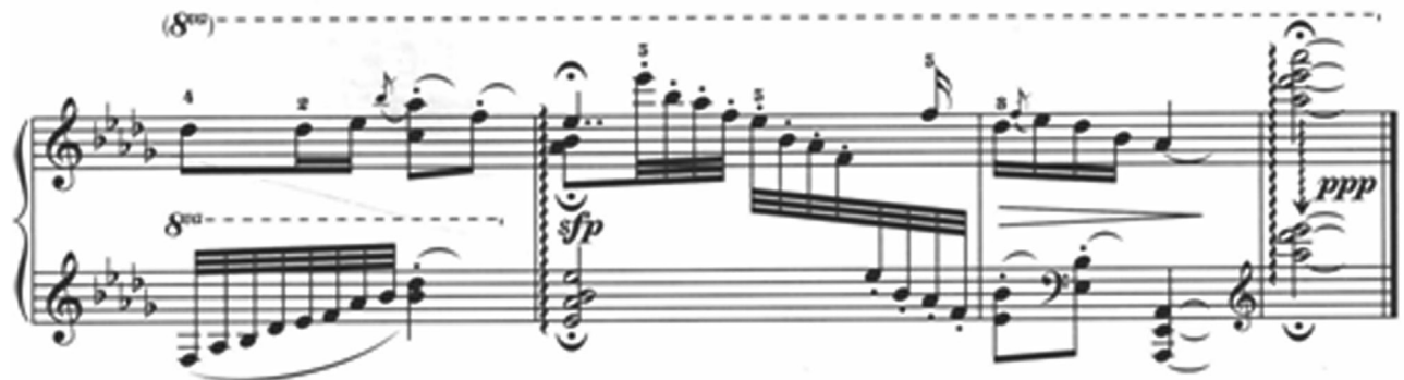
Figure 8: Liu Yang River.

The pentatonic scale is superimposed to form a special structure called a pentatonic chord. In the Lunar New Year, the composer uses this chord structure to make the melody more stable and thicker, and it also highlights the national music tastes. This is shown in Figure 7.