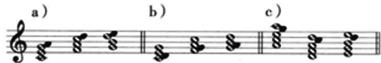
Figure 2: Add-on chord.