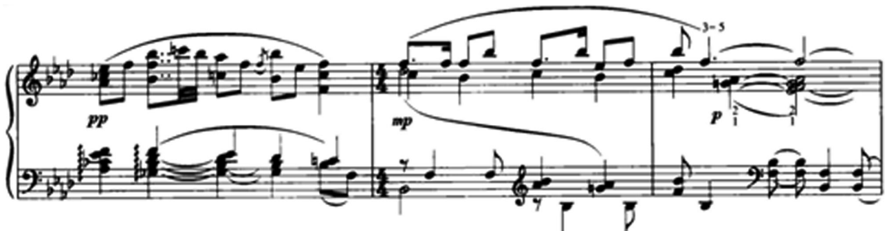
Figure 5: New Year's Day.

ask students to recite these melodies skilfully to broaden their vision, become familiar with the pentatonic style of Chinese folk music, and accumulate materials for the accompaniment of folk songs.