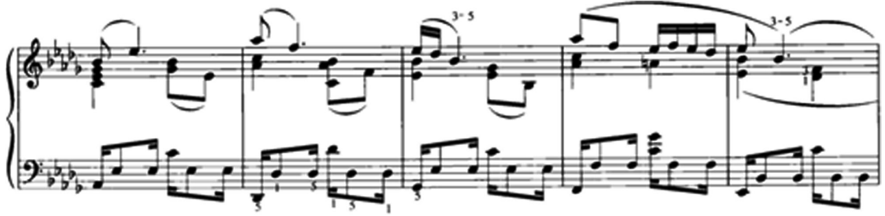
Figure 6: Love Song.